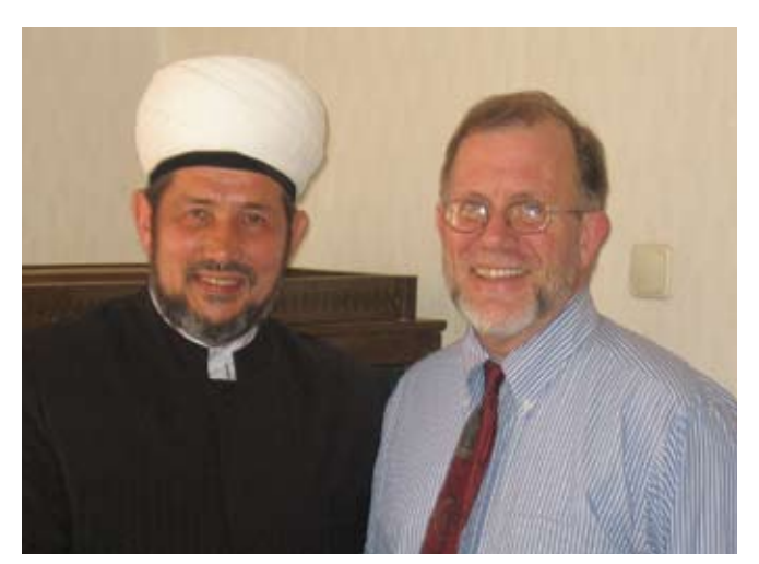
Commissioner Cromartie with Mufti Gusman Khazrat Iskhakov, head of the Council of Spiritual Affairs for Muslims of the Republic of Tatarstan.

According to human rights groups, a 2003 Russian Supreme Court decision to ban 15 Muslim groups for alleged ties to international terrorism has made it much easier for officials arbitrarily to detain individuals on extremism charges for alleged links to these groups. Police, prosecutors, and courts reportedly have used the decision to arrest and imprison hundreds of Muslims. It was not until July 2006 that the official government newspaper Rossiiskaya gazeta published a list of terrorist-designated organizations drawn up by the Federal Security Service (FSB)—a