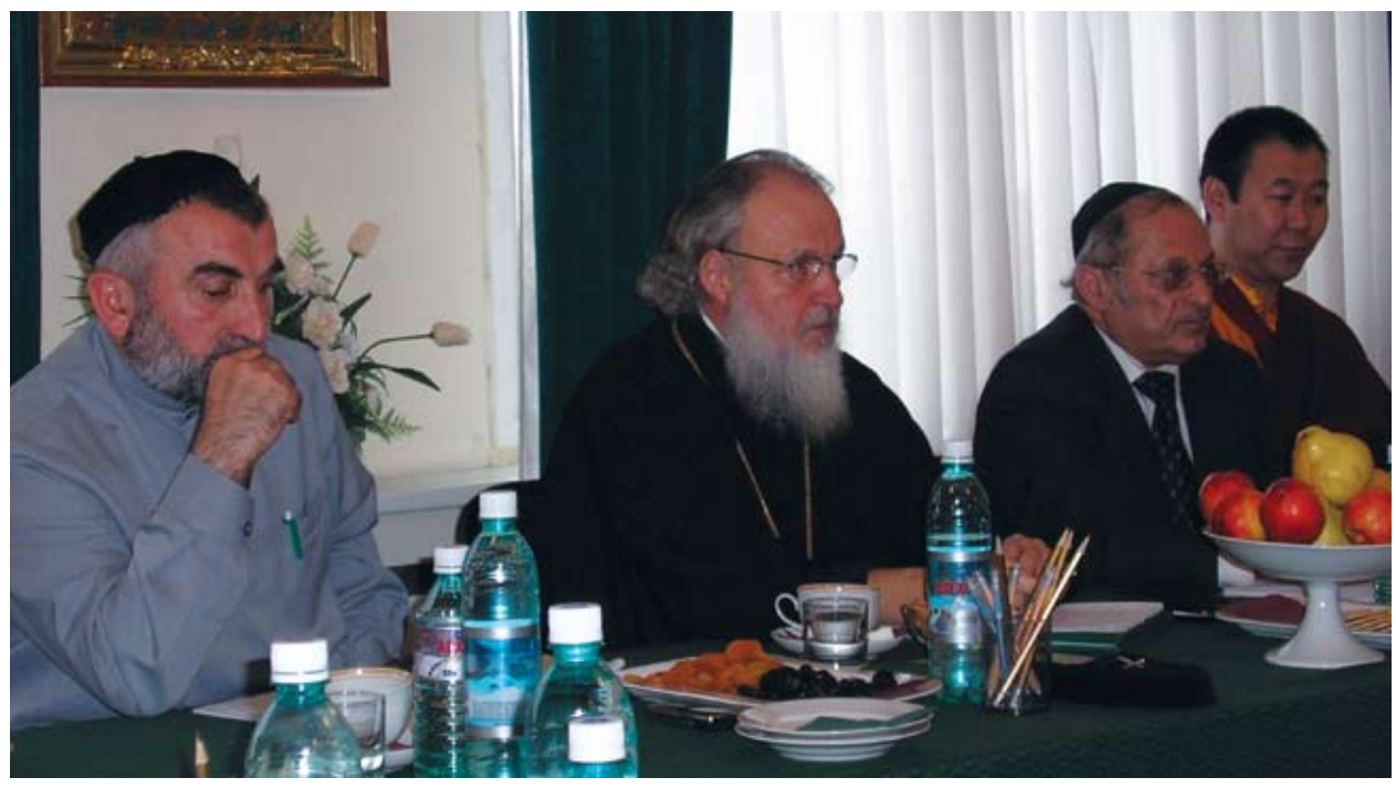
Members of the Inter-Religious Council of Russia meeting with the Commission delegation.

alleged extremists. Persons suspected by local police of involvement in alleged Islamist extremism have also reportedly been subjected to torture and ill-treatment in pre-trial detention, prisons, and labor camps.